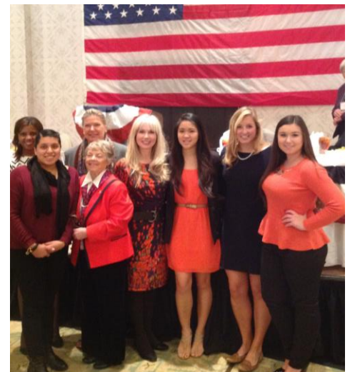
Our co-Presidents with 3 students from Pepperdine College Republicans and 1 student from Mount Saint Mary's College.