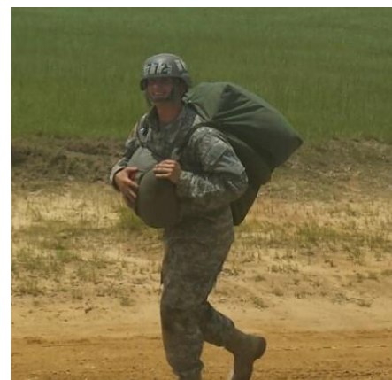
After completing the 4th Jump